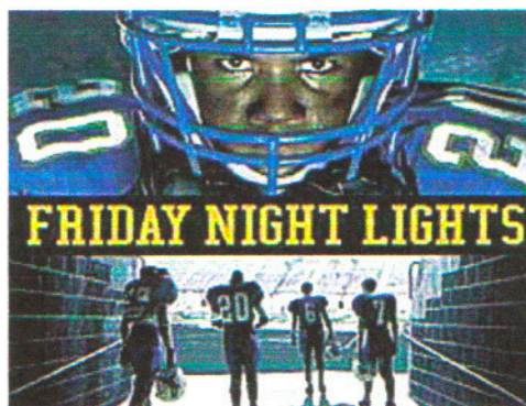
NBC's Friday Night Lights was inspired by the book.

© 2006 Fox Sports Interactive Media, LLC. All rights reserved. | Privacy Policy | Terms of Use