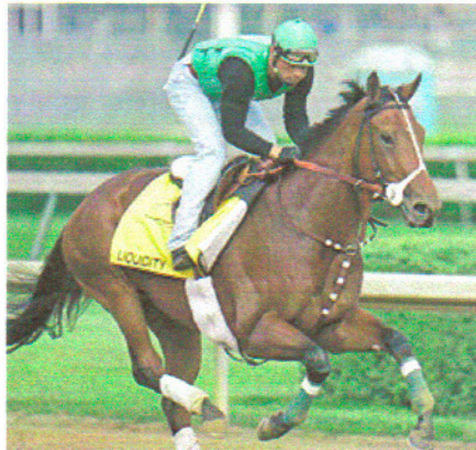
What will a philosophy degree from USC get you? This fine animal.